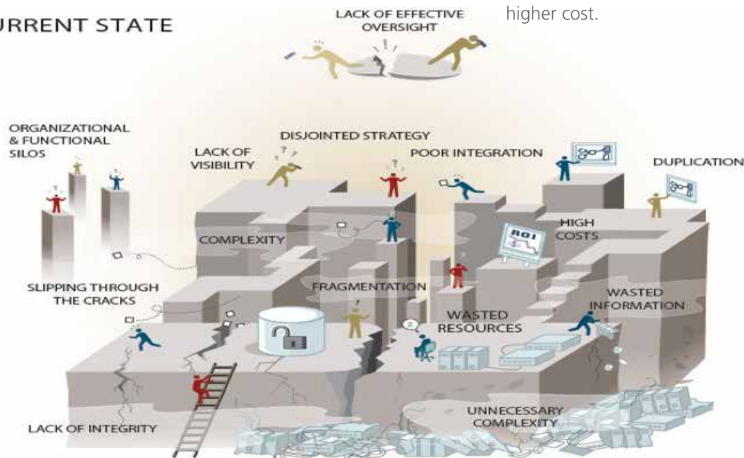
©2012 OCEG, Permission by OCEG is required for reproduction and/or use of material www.OCEG.org -- Derived from the OCEG GRC Illustrated Series

“Silo mentality begins at the level of our beliefs and places restrictive boundaries that inhibit employee engagement and programmatic organizational productivity.”